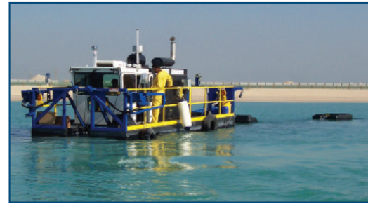
A Model 5012 LP removes silt from channels at a resort in the Middle East.